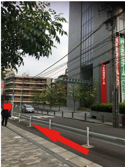
9. Walk straight