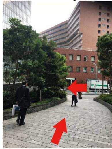
8. Turn left at the red building