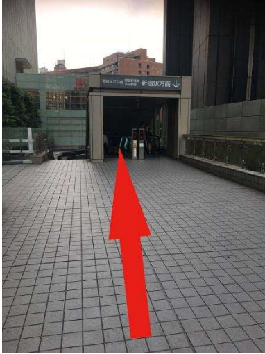
7. Walk straight