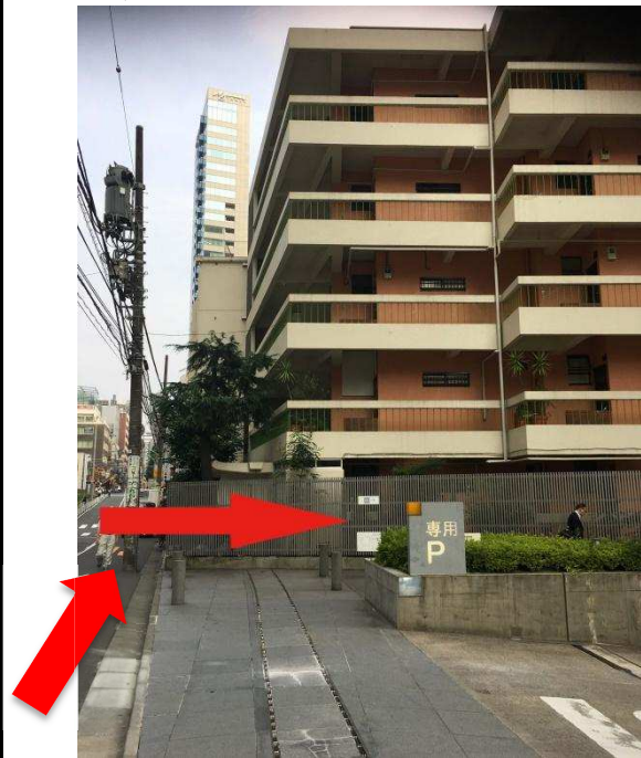
10. Turn right at the first street (corner of YOZEMI TOWER)