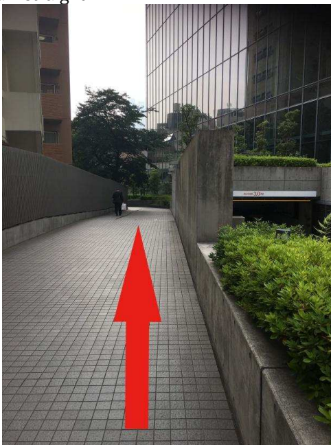
11. Walk straight